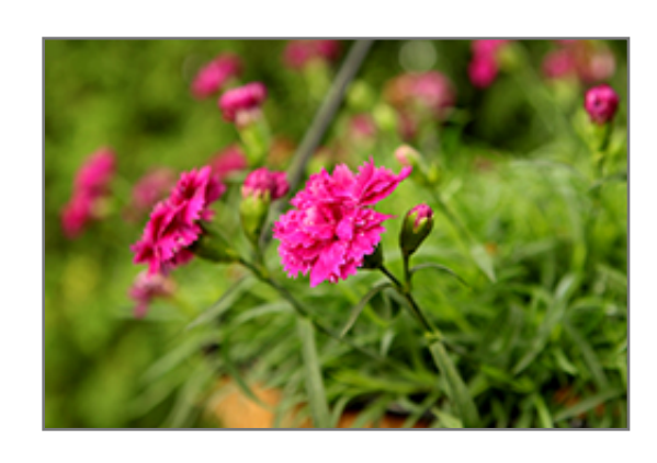
Falling In Love Rosie Pinks flowers

This is a relatively low maintenance plant, and is best cleaned up in early spring before it resumes active growth for the season. It is a good choice for attracting bees and butterflies to your yard, but is not particularly attractive to deer who tend to leave it alone in favor of tastier treats. It has no significant negative characteristics.