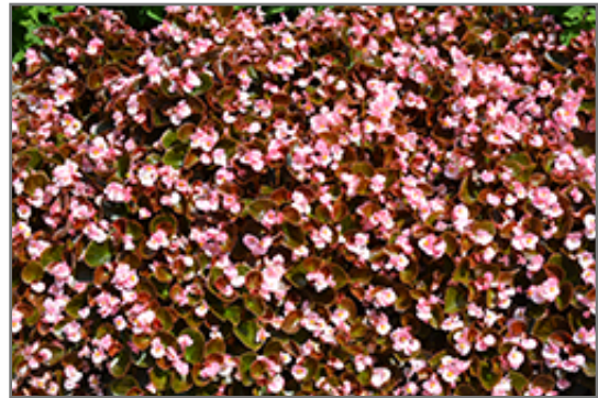
Cocktail Brandy Begonia flowers