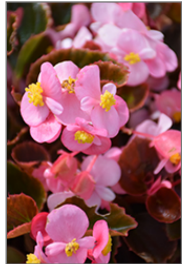
Cocktail Brandy Begonia flowers

Cocktail Brandy Begonia is an herbaceous annual with a mounded form. Its medium texture blends into the garden, but can always be balanced by a couple of finer or coarser plants for an effective composition.