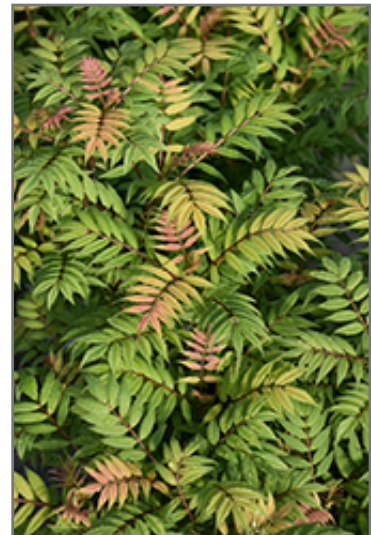
Mr. Mustard False Spirea foliage

2901 ST. MARY'S ROAD - WINNIPEG, MANITOBA - R2N 4A6 - (204) 255-7353