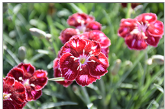
Mountain Frost Ruby Glitter Pinks flowers