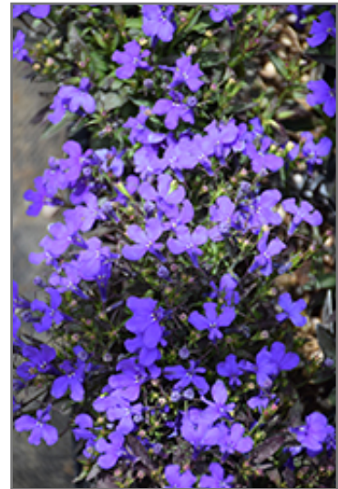
Crystal Palace Lobelia flowers

Crystal Palace Lobelia is an herbaceous annual with a mounded form. It brings an extremely fine and delicate texture to the garden composition and should be used to full effect.