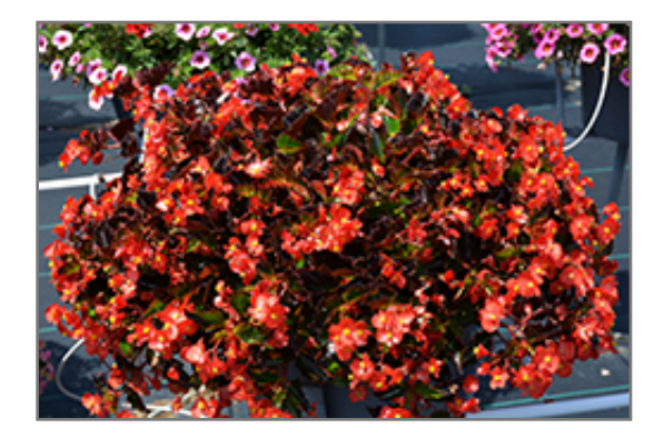
Hula Red Begonia in bloom