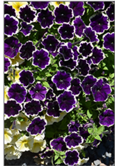
SureShot Blueberries & Cream Petunia flowers

SureShot Blueberries & Cream Petunia is a dense herbaceous annual with a trailing habit of growth, eventually spilling over the edges of hanging baskets and containers. Its medium texture blends into the garden, but can always be balanced by a couple of finer or coarser plants for an effective composition.