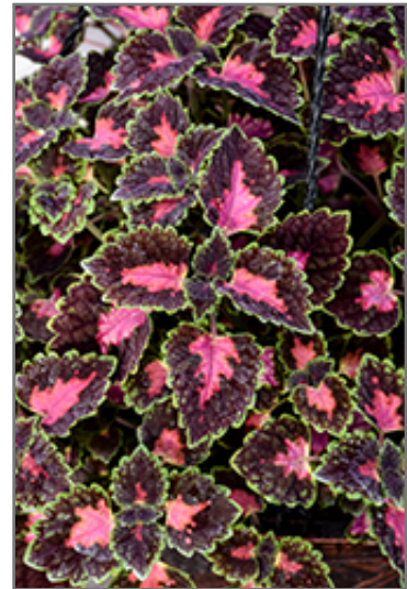
TrailBlazer Road Trip Coleus foliage

TrailBlazer Road Trip Coleus is an herbaceous annual with a ground-hugging habit of growth. Its medium texture blends into the garden, but can always be balanced by a couple of finer or coarser plants for an effective composition.