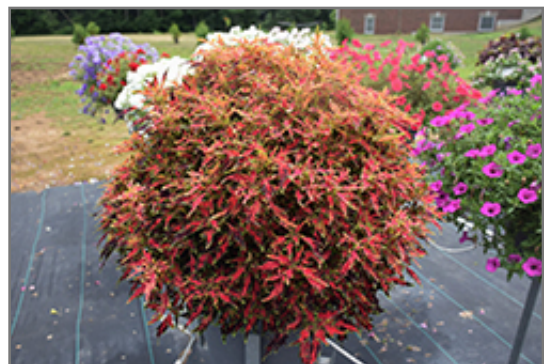
ColorBlaze Mini Me Watermelon Coleus