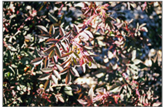
Red Leaf Rose foliage

This shrub should only be grown in full sunlight. It does best in average to evenly moist conditions, but will not tolerate standing water. It is not particular as to soil type or pH. It is highly tolerant of urban pollution and will even thrive in inner city environments. This species is not originally from North America.