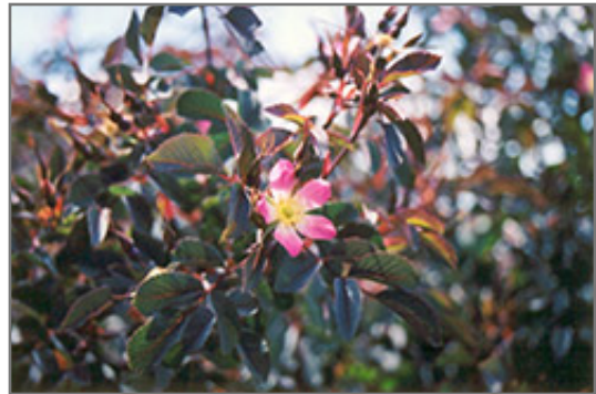
Red Leaf Rose flowers

Red Leaf Rose is a multi-stemmed deciduous shrub with a more or less rounded form. Its average texture blends into the landscape, but can be balanced by one or two finer or coarser trees or shrubs for an effective composition.