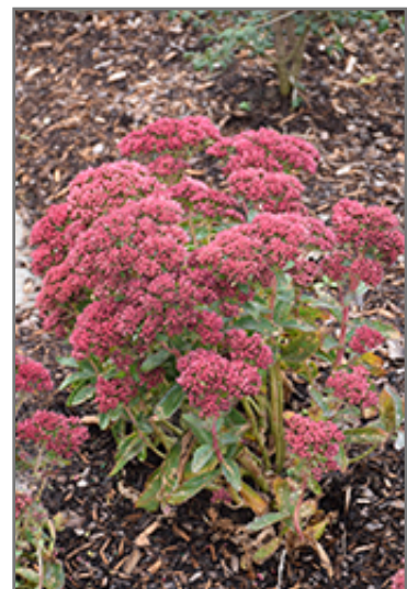
Munstead Dark Red Stonecrop in bloom