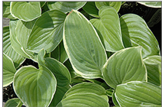
Frozen Margarita Hosta foliage

Frozen Margarita Hosta is a dense herbaceous perennial with tall flower stalks held atop a low mound of foliage. Its relatively coarse texture can be used to stand it apart from other garden plants with finer foliage.