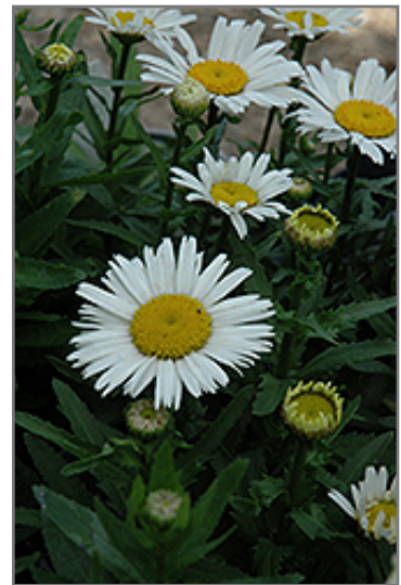
Snow Lady Shasta Daisy flowers