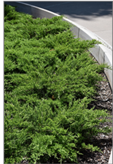
Broadmoor Juniper