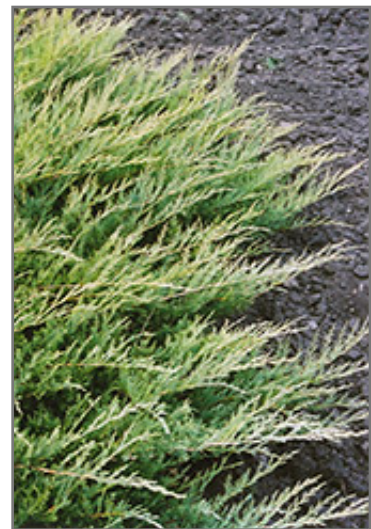
Broadmoor Juniper foliage