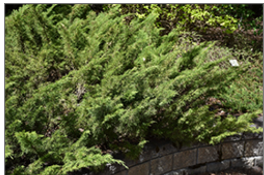
Skandia Juniper