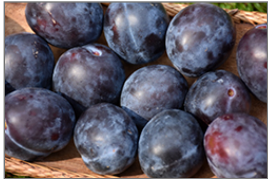
Mount Royal Plum fruit