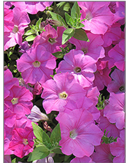
Easy Wave Pink Petunia flowers

Easy Wave Pink Petunia is a dense herbaceous annual with a trailing habit of growth, eventually spilling over the edges of hanging baskets and containers. Its medium texture blends into the garden, but can always be balanced by a couple of finer or coarser plants for an effective composition.