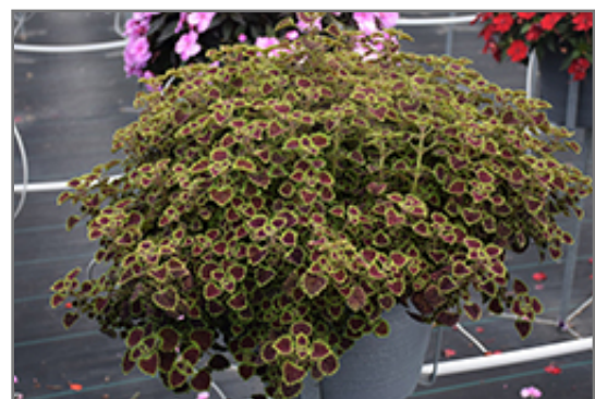
Burgundy Wedding Train Coleus