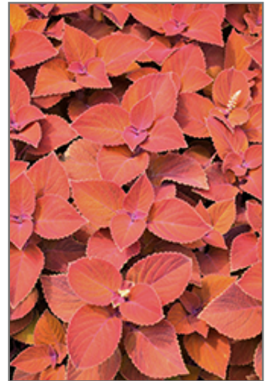
ColorBlaze Sedona Sunset Coleus foliage

ColorBlaze Sedona Sunset Coleus is recommended for the following landscape applications;