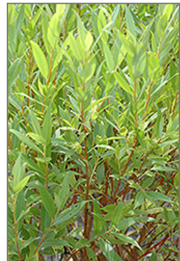
Flame Willow foliage

2901 ST. MARY'S ROAD - WINNIPEG, MANITOBA - R2N 4A6 - (204) 255-7353