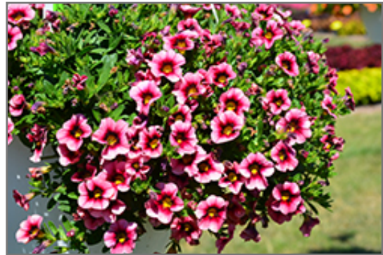
Hula Hot Pink Calibrachoa flowers

Hula Hot Pink Calibrachoa is a dense herbaceous annual with a trailing habit of growth, eventually spilling over the edges of hanging baskets and containers. Its medium texture blends into the garden, but can always be balanced by a couple of finer or coarser plants for an effective composition.