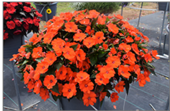
SunPatiens Compact Electric Orange New Guinea Impatiens in bloom