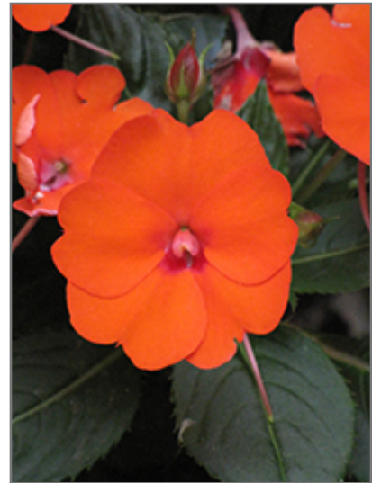
SunPatiens Compact Electric Orange New Guinea Impatiens flowers

SunPatiens Compact Electric Orange New Guinea Impatiens is a dense herbaceous annual with a mounded form. Its medium texture blends into the garden, but can always be balanced by a couple of finer or coarser plants for an effective composition.