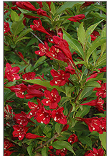
Red Prince Weigela flowers

This shrub will require occasional maintenance and upkeep, and should only be pruned after flowering to avoid removing any of the current season's flowers. It is a good choice for attracting hummingbirds to your yard. It has no significant negative characteristics.