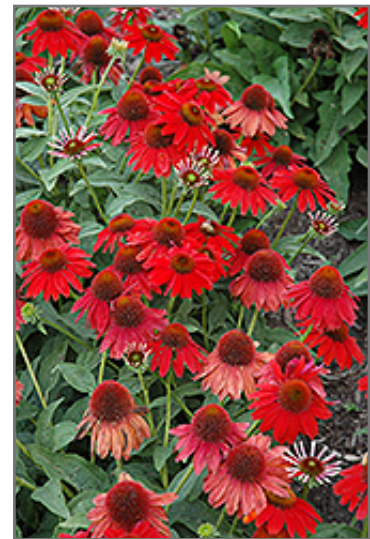
Sombbrero Salsa Red Coneflower flowers

Sombbrero Salsa Red Coneflower is an herbaceous perennial with an upright spreading habit of growth. Its medium texture blends into the garden, but can always be balanced by a couple of finer or coarser plants for an effective composition.