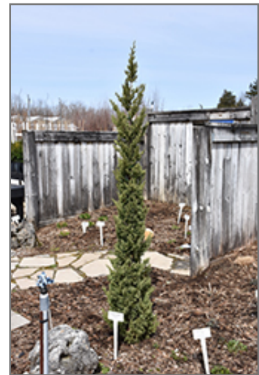
Trautman Juniper

This plant is not reliably hardy in our region, and certain restrictions may apply; contact the store for more information.