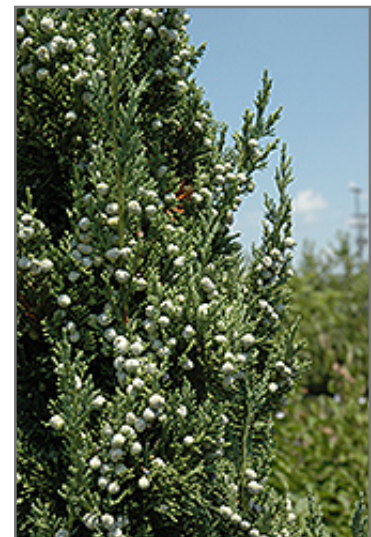
Trautman Juniper fruit