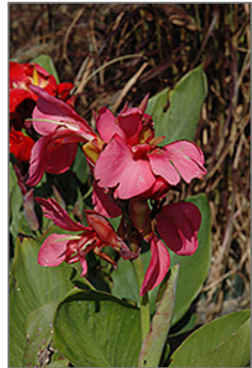
Tropical Rose Canna flowers

This plant is native to the tropics and prefers growing in moist environments with evenly warm conditions all year round. In our climate, it is usually grown as an outdoor annual in the garden or in a container. If you want it to survive the winter, it can be brought in to the house and provided with special care, and then returned to the garden the following season. In its preferred tropical habitat, it can grow to be around 26 inches tall at maturity, with a spread of 24 inches. However, when grown as an annual or when overwintered indoors, it can be expected to perform differently, and its exact height and spread will depend on many factors; you may wish to consult with our experts as to how it might perform in your specific application and growing conditions.