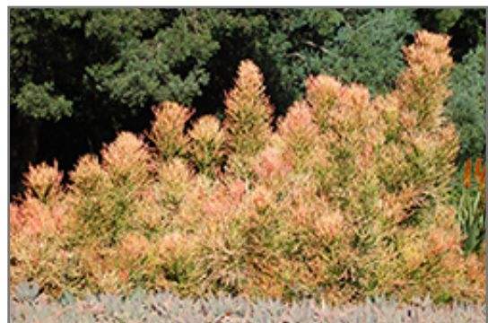
Sticks On Fire Red Pencil Tree