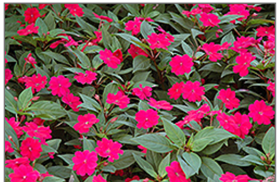
Bounce Cherry Impatiens in bloom