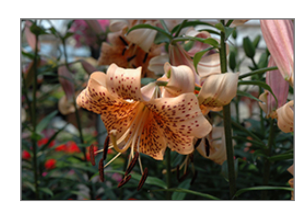
Splendens Tiger Lily flowers