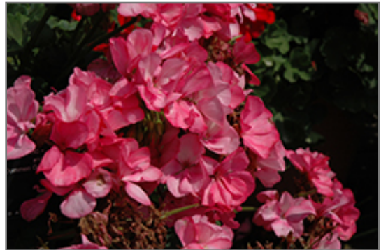
Big Ezee Pink Geranium flowers

Big Ezee Pink Geranium is an herbaceous annual with an upright spreading habit of growth. Its medium texture blends into the garden, but can always be balanced by a couple of finer or coarser plants for an effective composition.