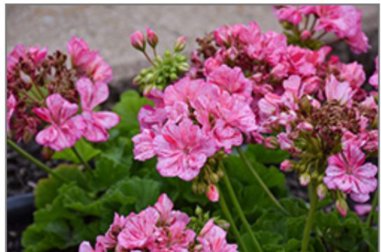
Big Ezee Pink Geranium flowers