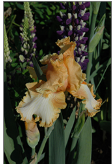
Cajun Rhythm Iris flowers

This plant will require occasional maintenance and upkeep, and should be cut back in late fall in preparation for winter. Deer don't particularly care for this plant and will usually leave it alone in favor of tastier treats. Gardeners should be aware of the following characteristic(s) that may warrant special consideration;