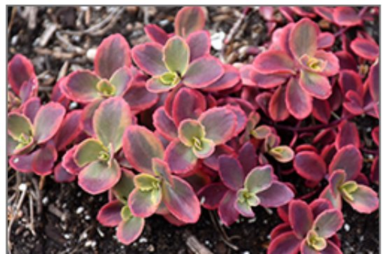
Sunsparkler Wildfire Stonecrop foliage