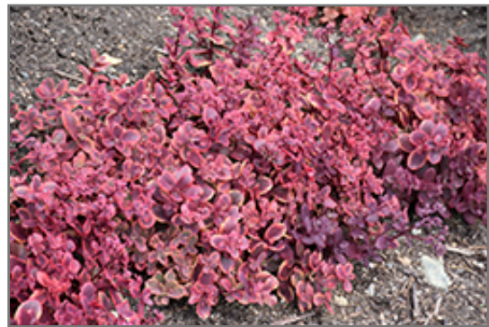
Sunsparkler Wildfire Stonecrop