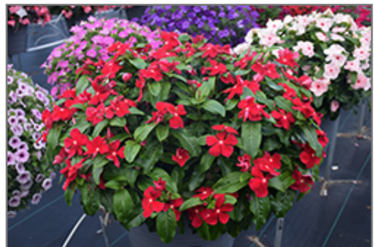
Titan Really Red Vinca in bloom