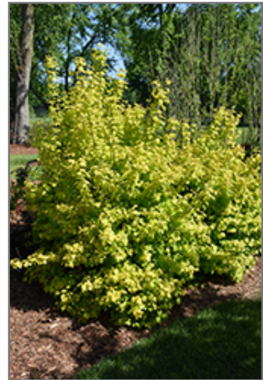
Oh Canada Cranberry Bush

This shrub does best in full sun to partial shade. It prefers to grow in average to moist conditions, and shouldn't be allowed to dry out. It is not particular as to soil type or pH. It is highly tolerant of urban pollution and will even thrive in inner city environments. This is a selected variety of a species not originally from North America.