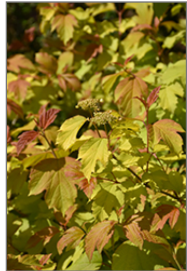
Oh Canada Cranberry Bush foliage

Oh Canada Cranberry Bush is a dense multi-stemmed deciduous shrub with a more or less rounded form. Its average texture blends into the landscape, but can be balanced by one or two finer or coarser trees or shrubs for an effective composition.