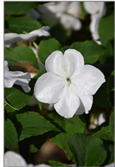
Beacon White Impatiens flowers

Beacon White Impatiens is a dense herbaceous annual with a mounded form. Its medium texture blends into the garden, but can always be balanced by a couple of finer or coarser plants for an effective composition.