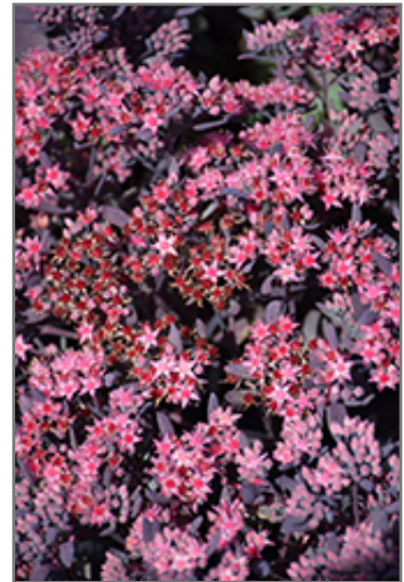
Plum Dazzled Stonecrop flowers

Plum Dazzled Stonecrop is covered in stunning panicles of pink flowers with rose eyes rising above the foliage from late summer to mid fall, which emerge from distinctive dark red flower buds. The flowers are excellent for cutting. Its attractive succulent round leaves emerge bluish-green in spring, turning plum purple in colour throughout the season. The burgundy stems are very colorful and add to the overall interest of the plant.