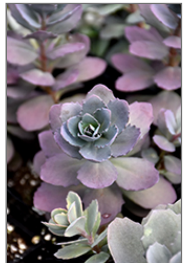
Plum Dazzled Stonecrop foliage

2901 ST. MARY'S ROAD - WINNIPEG, MANITOBA - R2N 4A6 - (204) 255-7353