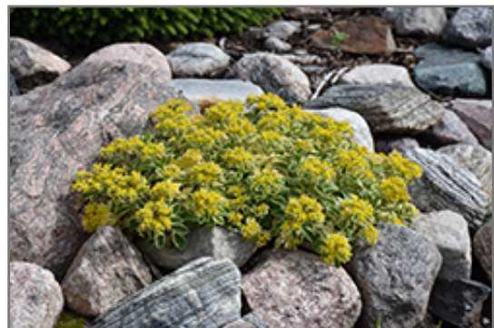
Atlantis Stonecrop in bloom