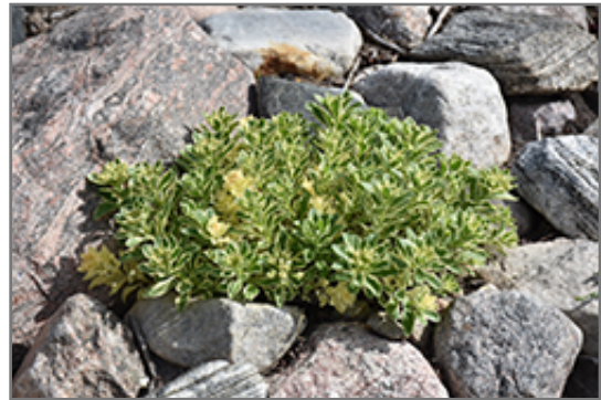
Atlantis Stonecrop