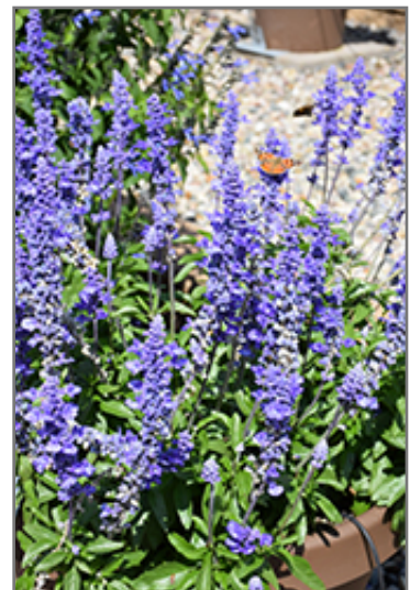
Unplugged So Blue Salvia flowers

2901 ST. MARY'S ROAD - WINNIPEG, MANITOBA - R2N 4A6 - (204) 255-7353