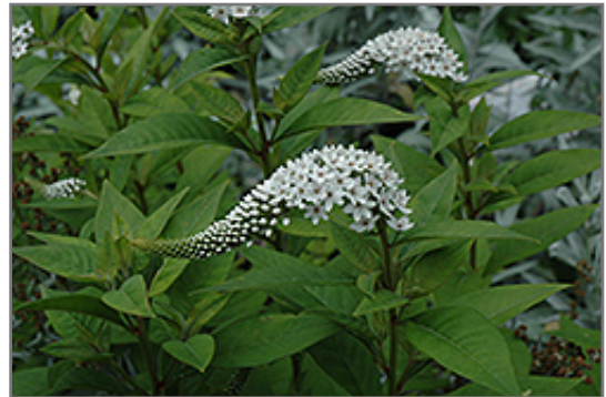
Gooseneck Loosestrife flowers