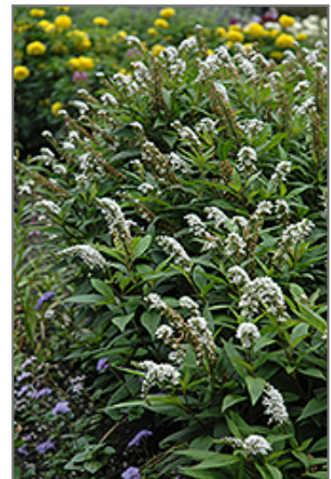
Gooseneck Loosestrife in bloom