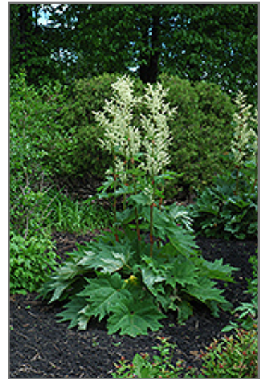
Ornamental Rhubarb in bloom

This plant will require occasional maintenance and upkeep, and should be cut back in late fall in preparation for winter. Deer don't particularly care for this plant and will usually leave it alone in favor of tastier treats. It has no significant negative characteristics.