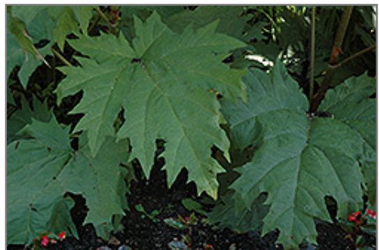
Ornamental Rhubarb foliage