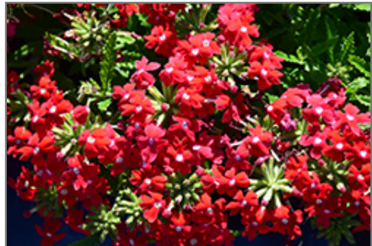
Obsession Cascade Red with Eye flowers

Obsession Cascade Red with Eye is an herbaceous annual with a ground-hugging habit of growth. It brings an extremely fine and delicate texture to the garden composition and should be used to full effect.