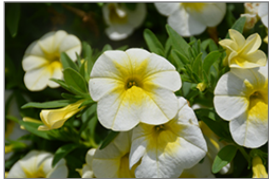
Cha-Cha Frosty Lemon Calibrachoa flowers

Cha-Cha Frosty Lemon Calibrachoa is a dense herbaceous annual with a mounded form. Its medium texture blends into the garden, but can always be balanced by a couple of finer or coarser plants for an effective composition.