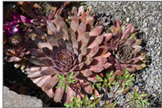
Kalinda Hens And Chicks

Kalinda Hens And Chicks is a dense herbaceous perennial with tall flower stalks held atop a low mound of foliage. Its relatively fine texture sets it apart from other garden plants with less refined foliage.