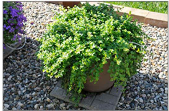
Indian Mint

Indian Mint is recommended for the following landscape applications;