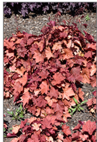
Carnival Cinnamon Stick Coral Bells

2901 ST. MARY'S ROAD - WINNIPEG, MANITOBA - R2N 4A6 - (204) 255-7353