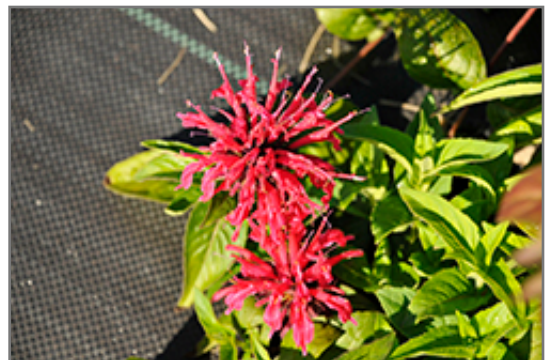
BeeMine Red Beebalm flowers