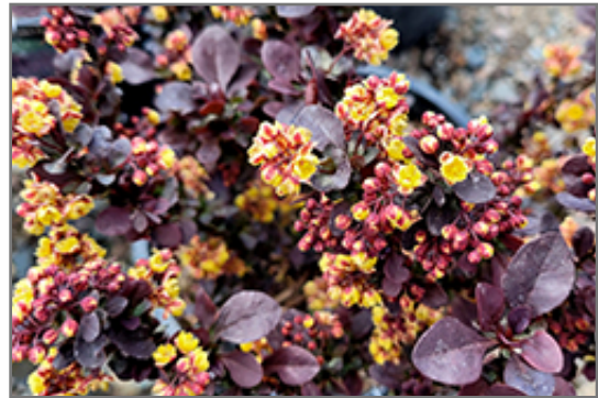
Concorde Japanese Barberry flowers