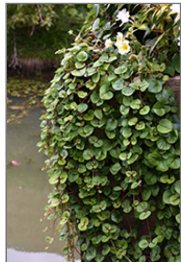
HILLIER Sunburst Moneywort

2901 ST. MARY'S ROAD - WINNIPEG, MANITOBA - R2N 4A6 - (204) 255-7353