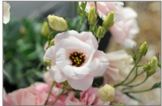
Echo Pink Lisianthus flowers

This plant will require occasional maintenance and upkeep, and should not require much pruning, except when necessary, such as to remove dieback. It is a good choice for attracting bees and butterflies to your yard. It has no significant negative characteristics.