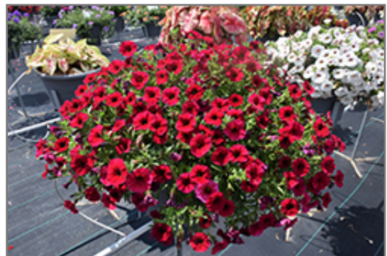
SuperCal Royal Red Petchoa in bloom