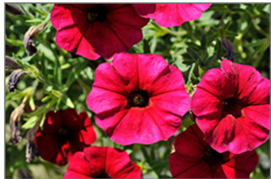
SuperCal Royal Red Petchoa flowers